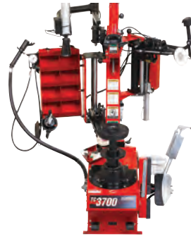
Shown with optional Side Shovel