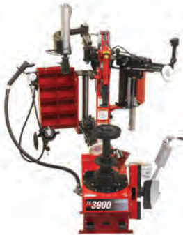
Shown with optional Side Shovel