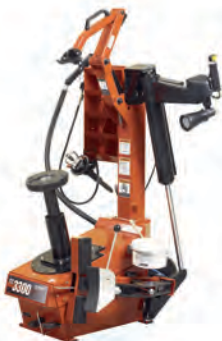
Shown with optional Plus Roller