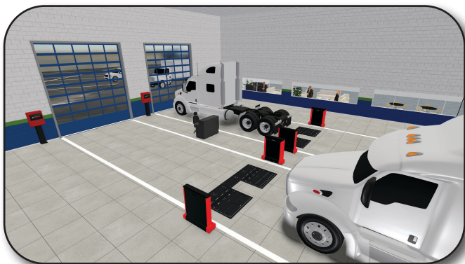
Quick Check Drive HD™ Installation

NOTE: See form QM07936-05 for complete information, including environmental specifications and UL certifications.