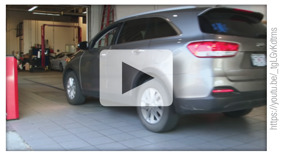
Techs have doubled production and the store has had their most successful month for alignments yet!