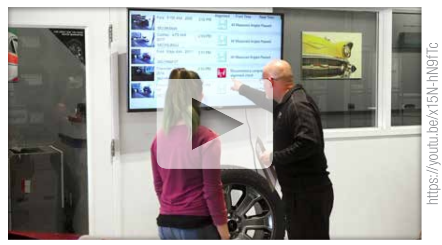
Service Advisors were able to schedule an additional one to two alignments (on average) using Flightboard™!