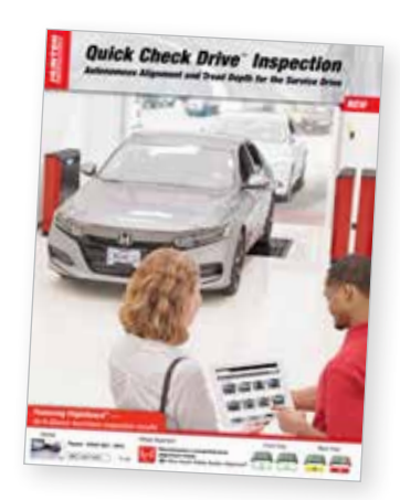
Check out other Hunter literature for more detailed product information.